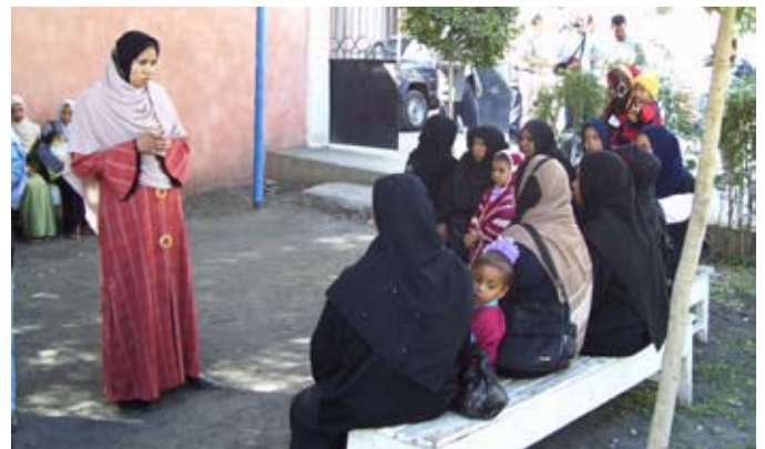
A health outreach worker from the Kom Ombo MCH Center team, speaking to clients about the center's family planning services.

Aswan, Daraw, and Kom Ombo Districts each took the revised program to five new health units in their areas. Despite little funding or external technical assistance, the modified program became a great success. Every one of the participating teams identified a service delivery challenge in their community to work toward. Every team scanned their community to collect data for their challenge. And every team prepared a written action plan, and mobilized the resources needed to meet their challenge. 1