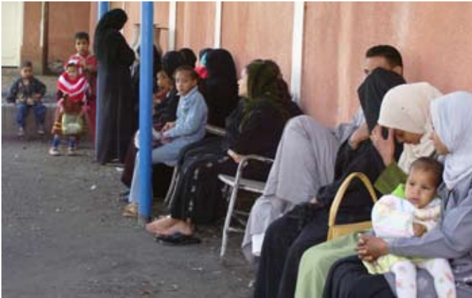
Serving clients well: a sheltered and comfortable waiting area outside the Kom Ombo Maternal and Child Health Clinic.

The LDP proved so inspirational and its results so tangible and significant, that the program's recipients did not allow it to wither away, but instead took on the monumental task of becoming the program's facilitators, and growing the seedling of leadership in Aswan and then in other governorates and countries.